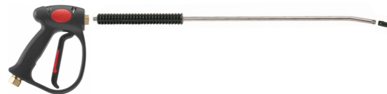
MV 925 + SF 12 Lance + Variable Nozzle