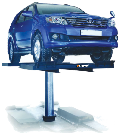
→ TYRE REST PLATFORM / BUTTERFLY VARIANT