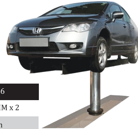
→ SINGLE POST LIFT