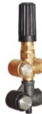
Unloader Valve Internal Bypass