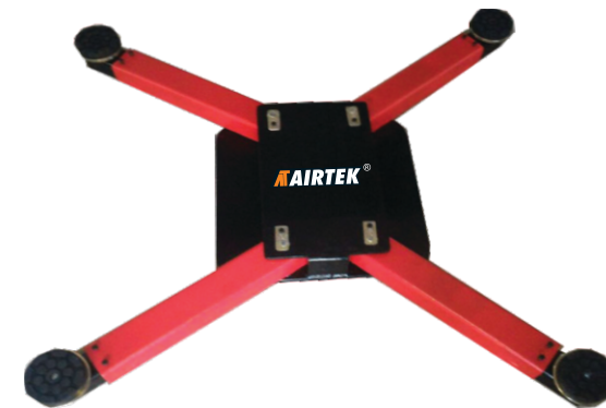
SPIDER ARMS ←