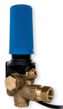
Bypass Valve with Pressure Switch