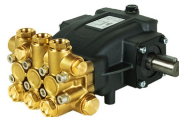
PM 12.170R ( 5 HP / 170 BAR ) Mazzone - Italy