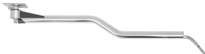
360 Degree Rotating boom