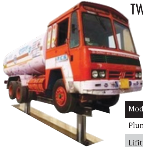
TWIN POST LIFT ←