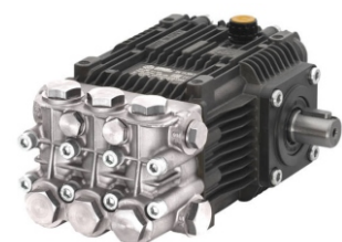
AT.RK 15.20 HN