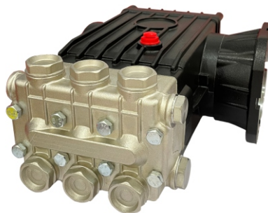
AT 1218/H - 5 HP/170 BAR