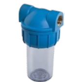
50 Micron Filters Optional Accessory