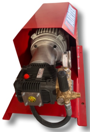
AT 1218 - Complete Assembly