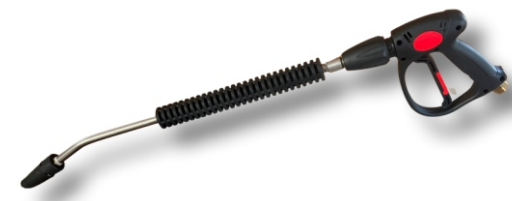
MV 925 + QRC + SF 12 Lance + Variable Nozzle