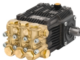
AT.RK 11.20 N