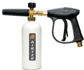
Snow Foam Lance