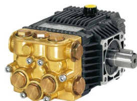
AT.XT 11.15 N