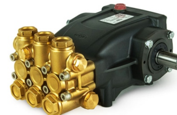
MMD 12.250R ( 7.5 HP / 250 BAR ) Mazzone - Italy